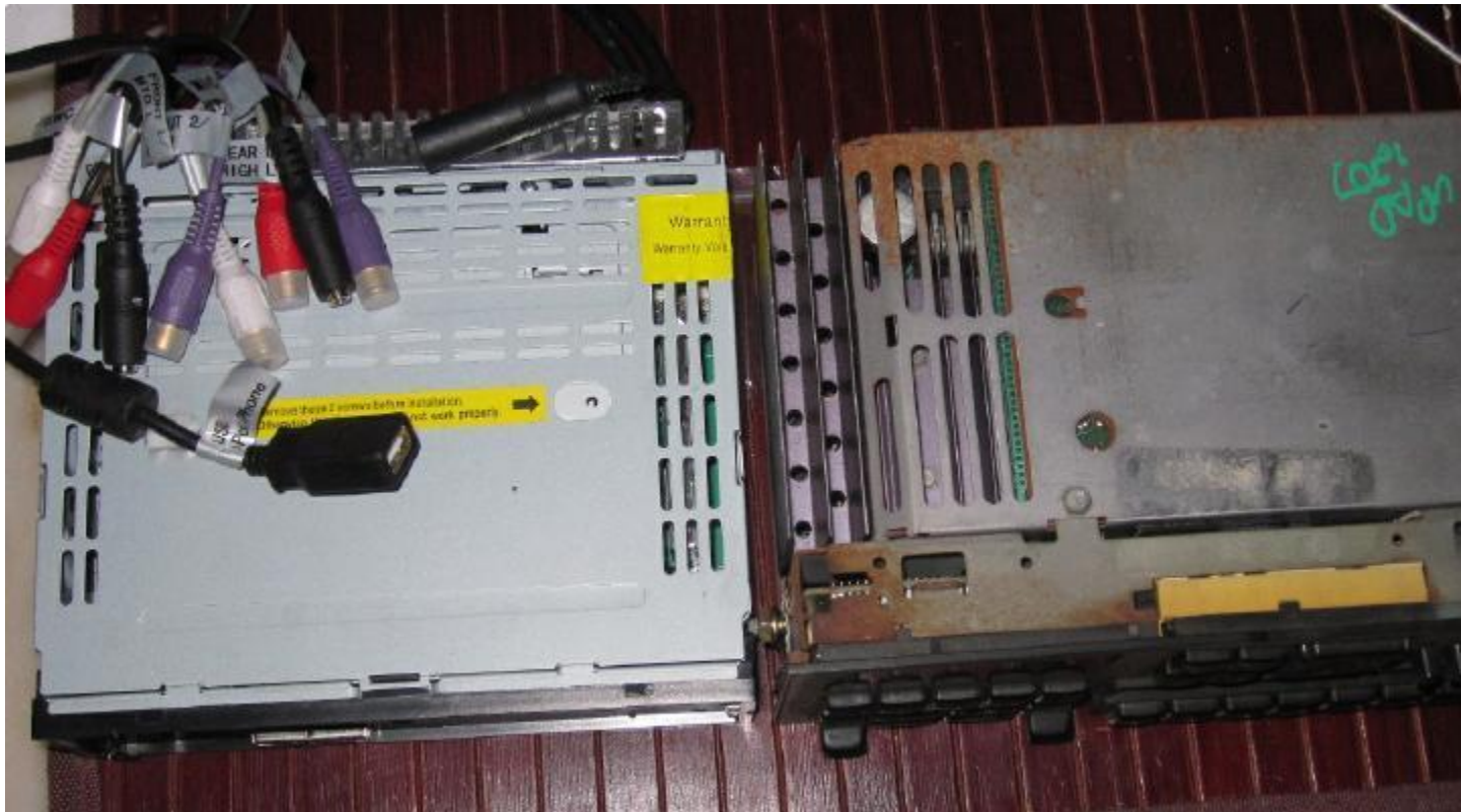
Clarion on left, Delco on right.

Everything works just fine but there is an issue: the unit is too long to fit the '90 Reatta dash properly.